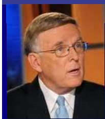
Byron Dorgan (US Senator):

While the Owner may delegate the tasks, they ultimately bear responsibility for the appointment of the project team: the Project Manager, the Irrigation Consultant, the Products, the Installer and the Maintenance Staff.